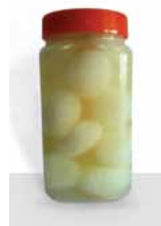
Rasgullas packed in the container t=3 months